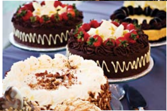
A Cake Story , price available upon request.

EDITOR ROSEANNE DELA ROSA. FOR AVAILABILITY SEE GET THE GOODS.